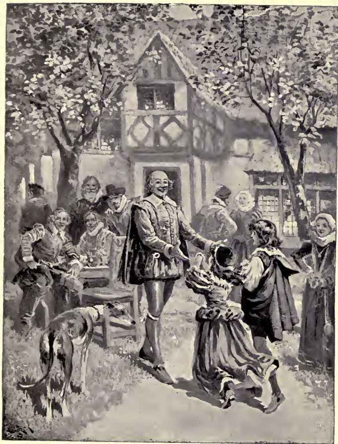
Master Shakespere met them with outstretched hands.